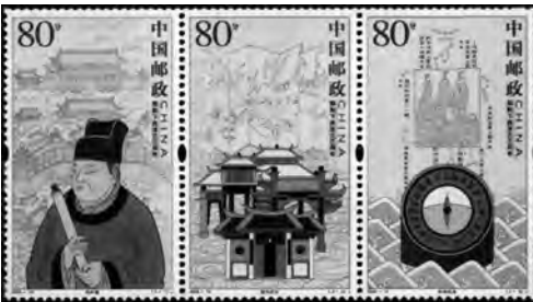
Set of commemorative stamps issued for the 600th anniversary of Zheng He's voyages to western seas.

torical map of China's administrative divisions to make the most advanced map of its time, the Kangnido World Map. During these centuries, European shipmakers adopted several important Chinese technological innovations, including the adjustable rudder, watertight compartments, and the compass.