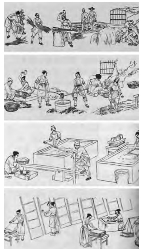
The woodblock prints show some of the six major stages in papermaking, recorded in a seventeenth-century book The Exploitation of the Works of Nature .

Invented in the second century BCE, paper enjoyed wide use throughout China by 300 CE. The technology for paper-making spread to the Islamic world in the eighth century, to Spain in the tenth century, to Italy in the eleventh, and throughout Europe after that.