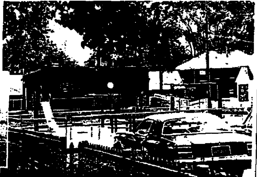
Real and symbolic barriers mark the transition from public street to private neighborhood. Fences define the territory assigned to individual units (below and left).