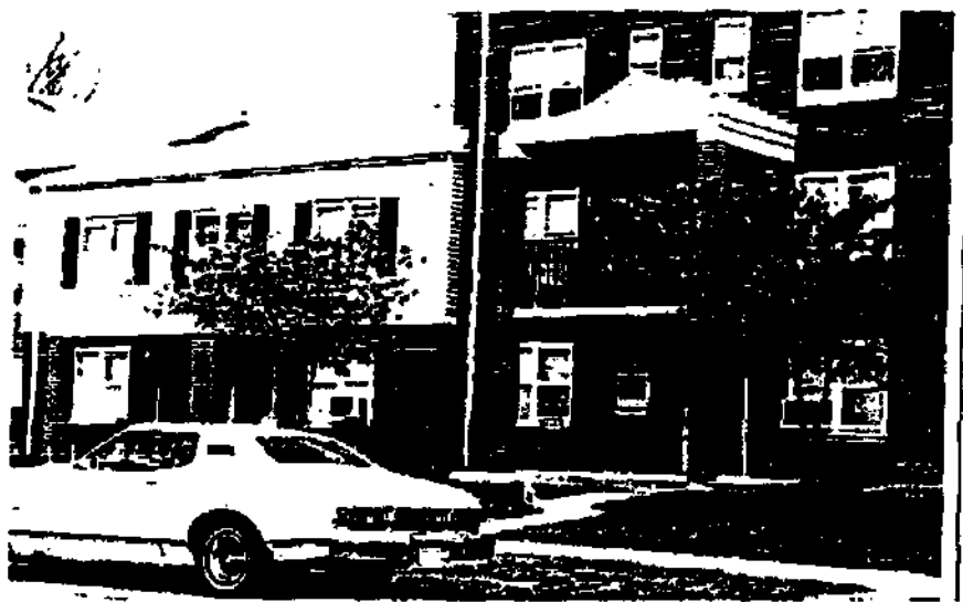
Relatively minor modifications to this apartment building in Louisville, Kentucky, drastically change the concept of territory by bringing the apartment out into the yard.