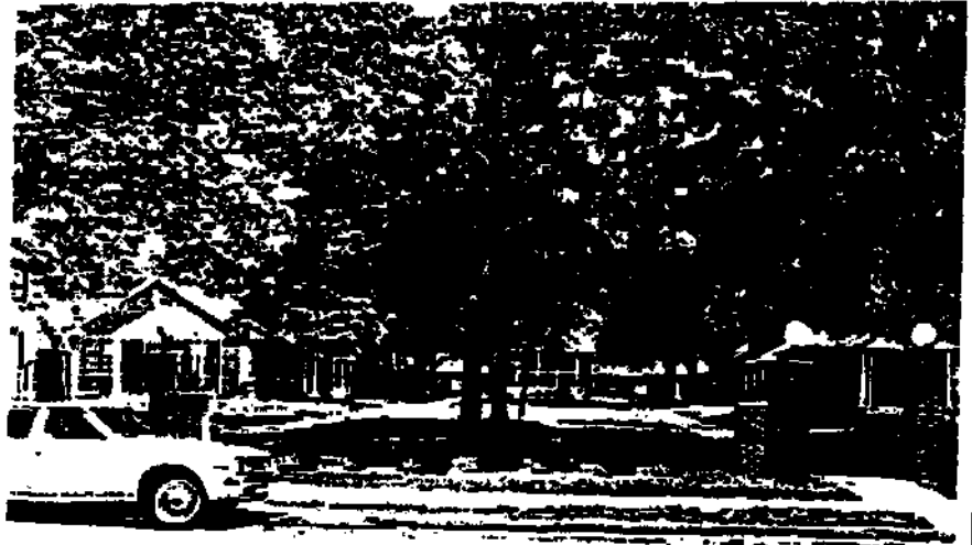
Clusters of homes surround a courtyard that contains both parking and resident recreation facilities. Residents can see what is going on, but outsiders cannot (above right).